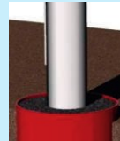
Composite ground sleeve length 70-100cm