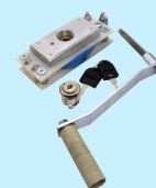
Hoisting winch (option)