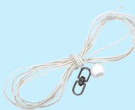
Rope (kevlar) with swivel and a distance ball