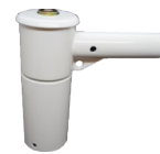
Rotating socket with BANER arm (fiberglass flagpoles)