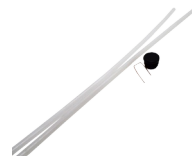
Windtracker bands (set)